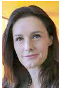
Heike Reichelt World Bank