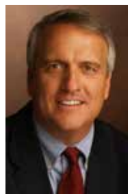
Bill Ritter, Jr. Center for the New Energy Economy, Colorado State University